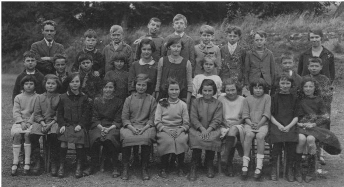
Michelmersh School pupils circa 1930/31